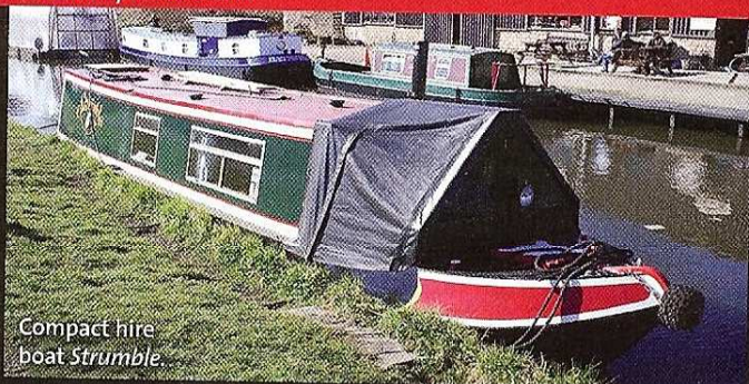
Compact hire boat Strumble .

and £595 to £1,230 for a full week, including fuel. We also liked Strumble , a 32ft, traditional Doug Moore boat for two people with a similar 'private boat' feel. This is very competitively priced, from £276 to £488 for a short break. There are no extras applied to the price: diesel, solid fuel, and gas are all included, and the security deposit is returnable.