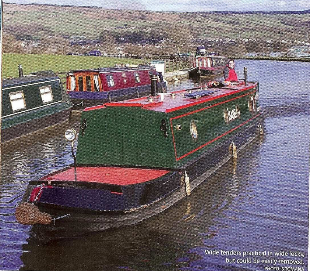
Wide fenders practical in wide locks, but could be easily removed.

Going astern, the engine initially skewed slightly due to prop-walk, but then she steered well backwards. The engine stopped the boat promptly, and should have more than enough grunt for fast tidal work.