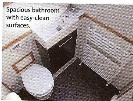
Spacious bathroom with easy-clean surfaces.